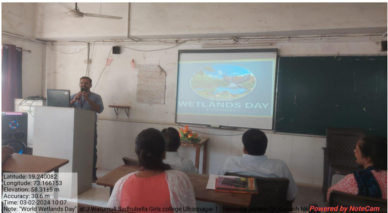
Organised seminar on World Wetland Day, 03.02.2024