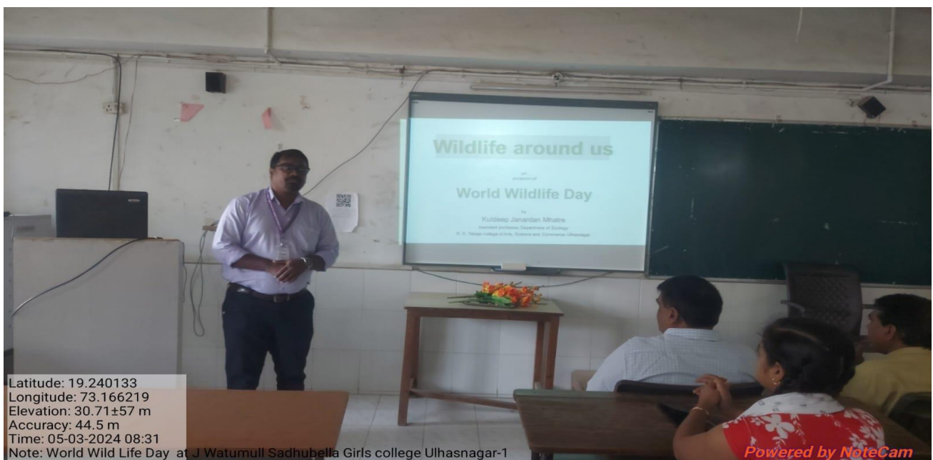
Organised seminar on World Wild Life Day, 05.03.2024