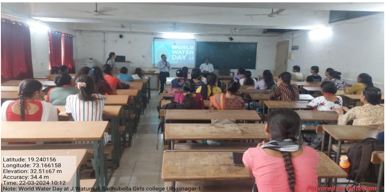
Organised seminar on World water Day, 22.03.2024