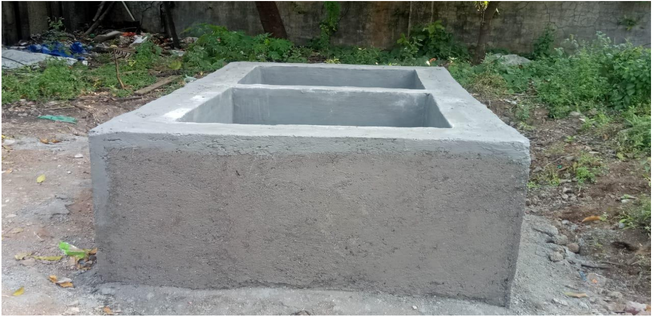
Permanent compost pit for litter in college campus to school side