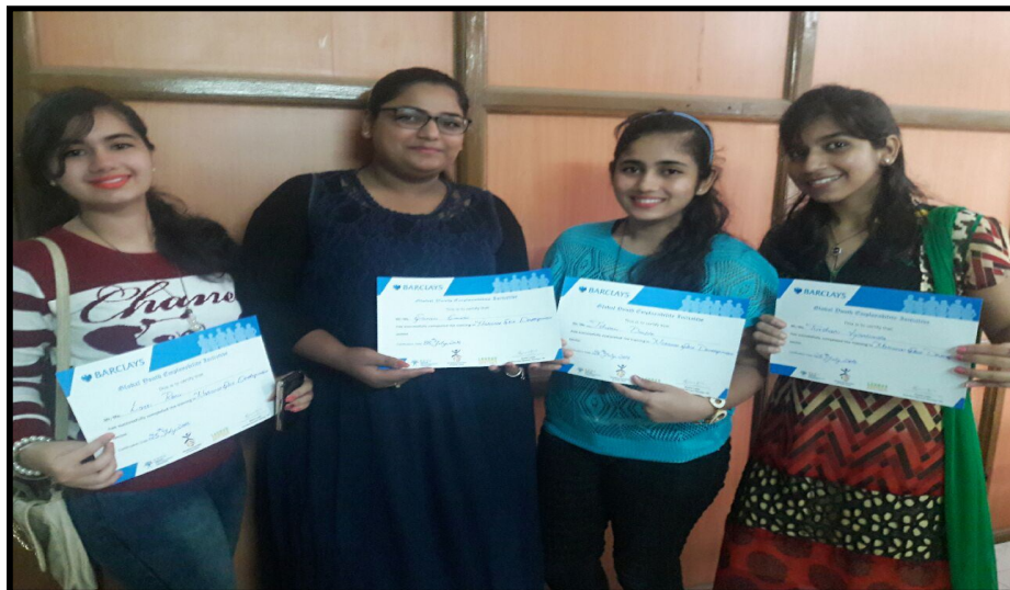
Students Receiving NSDC Certificates