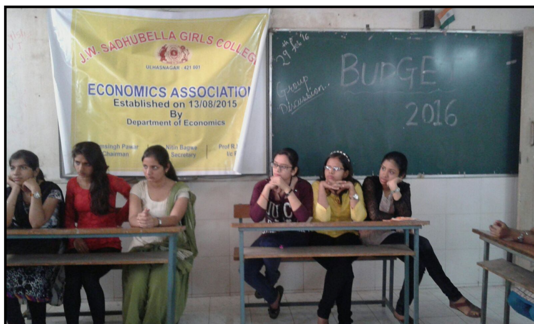
TY. B.COM Students participating in Group Discussion

Around eight teams of third year participated in it. The very purpose was to enable students a clear understanding of the budget and the components of the same. How far the government take initiatives in determining the price of private and public goods. What else revisions are required in case of merit and social goods was explained. The principle of maximum social advantage was also discussed.