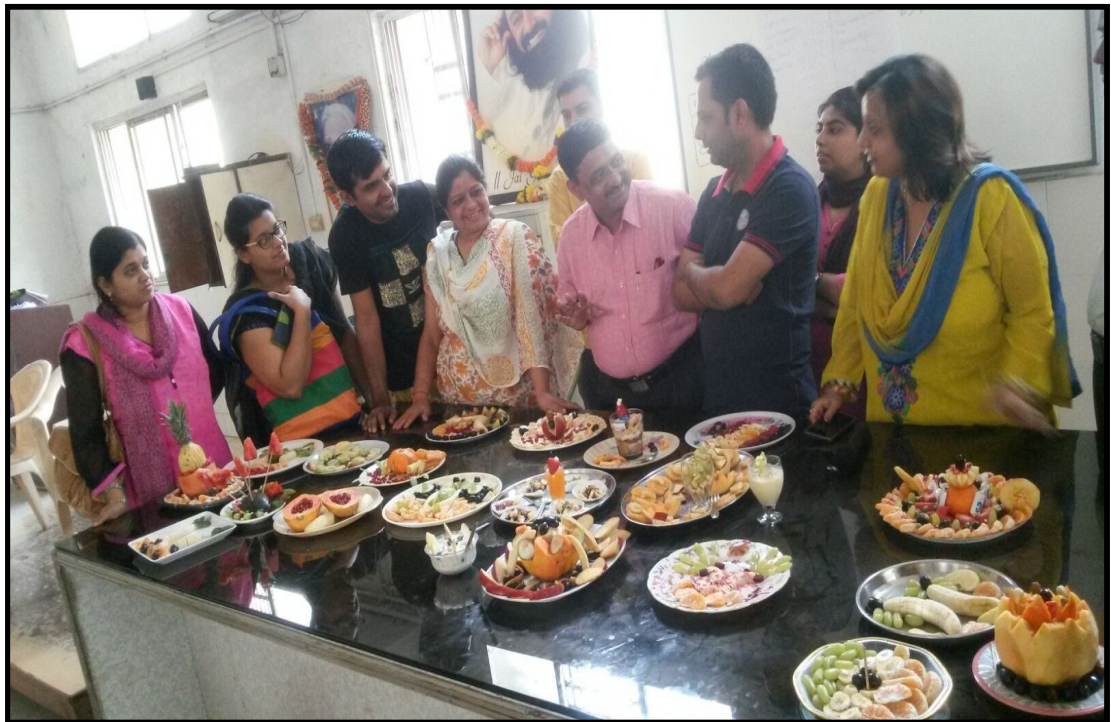
Salad Decoration Competition Under AOL Program