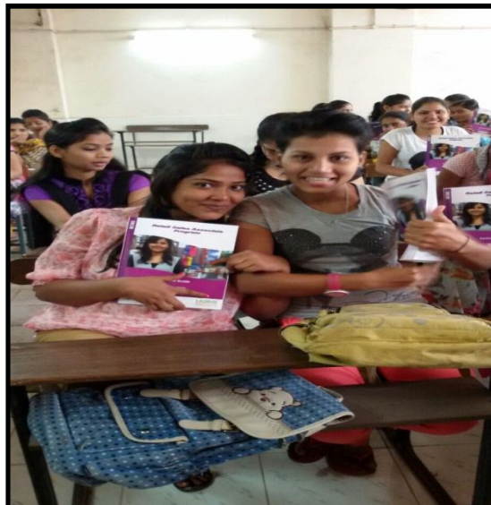
Students with Course Work material received from NSDC