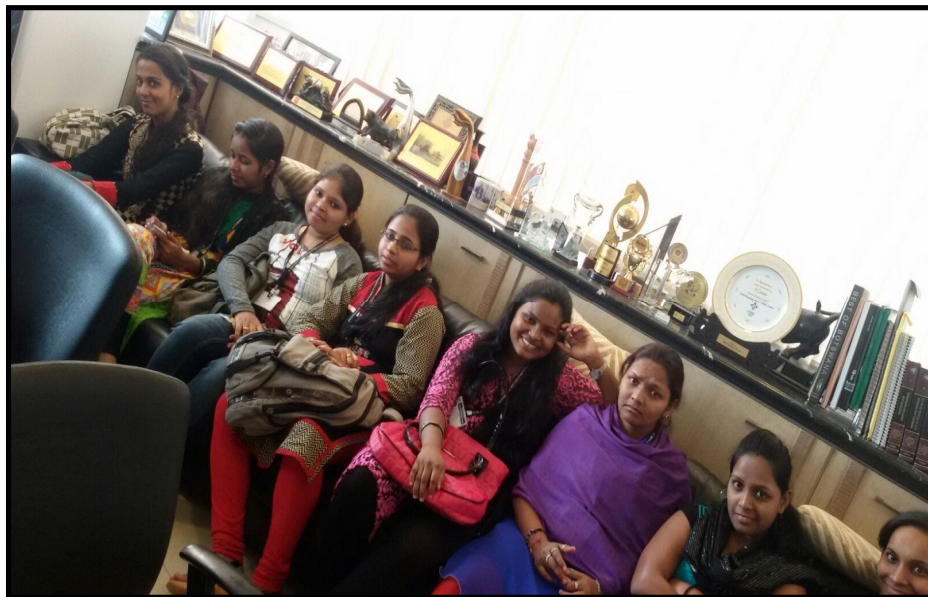
Students at BSE