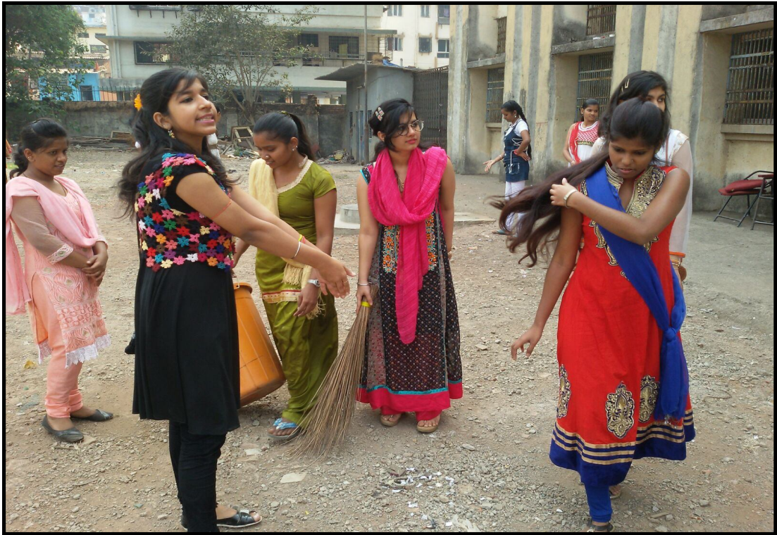
Swachh Bharat Abhiyan under AOL Program