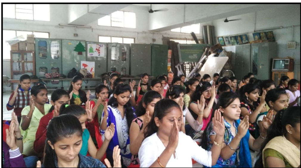
Students in Mind Relaxation Therapies Lecture