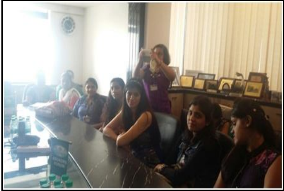
M.Com. students at BSE