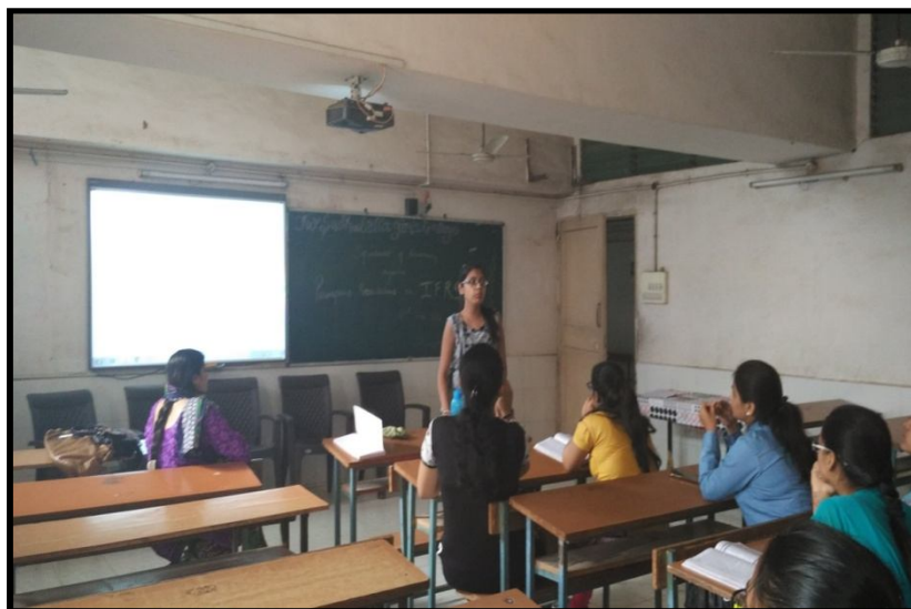
M.COM students making PPT Presentation