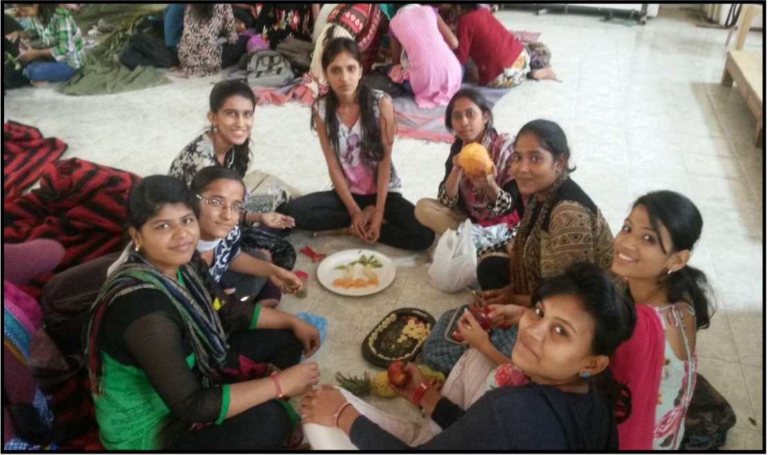
Students in the Priti Bhojan Activity