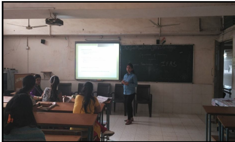
M.COM students making PPT Presentation

PPT sessions were organized for M.COM Students for the subject Auditing where all students were given chance to combine their presentation skills and expression of their content knowledge. The interactive session was also carried out where students did a group discussion on company audits.