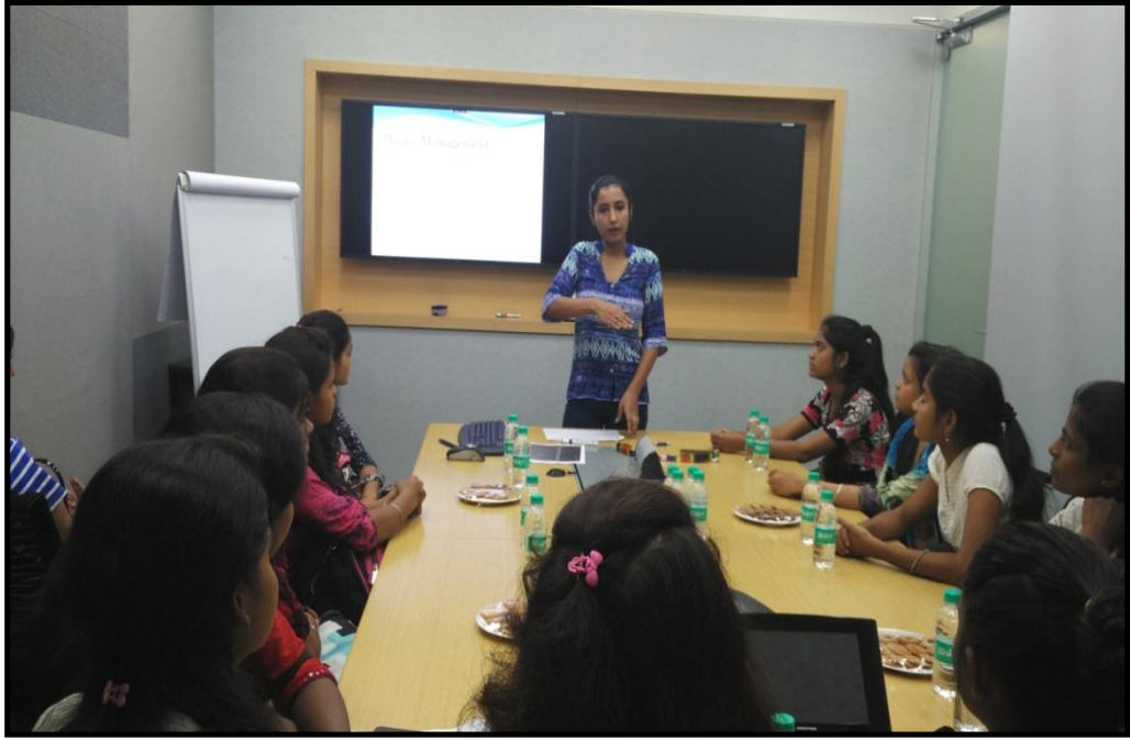
Barclays Personnel conducting Seminar