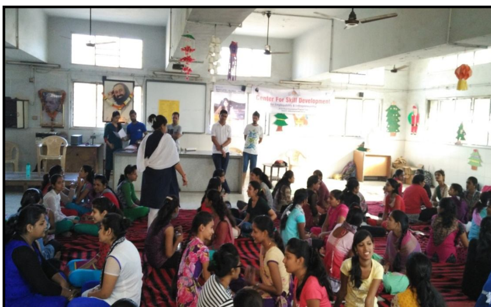
AOL Team and students in story telling activity

In order to promote social and spiritual development in the students, J. Watumull Sadhubella Girls college ran Art of living program for the final year students of B.Com, BMS and BCBI. The art of living program was a combined package of NSDC i.e national skill development corporation which was initiated through the CSR project of Barclays Bank which was termed as “Employability Skills Enhancement”.