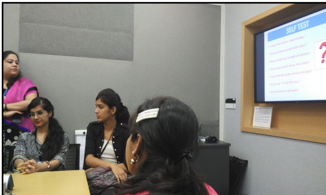
Students attending seminar at Barclays