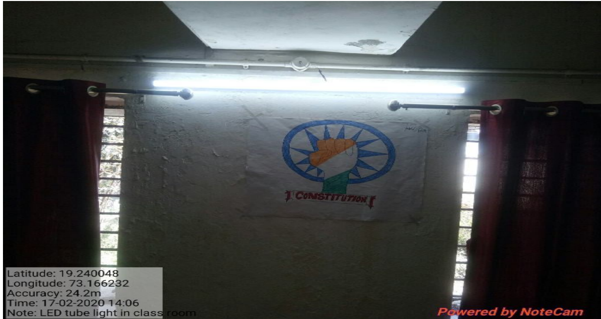
LED tube light in class room