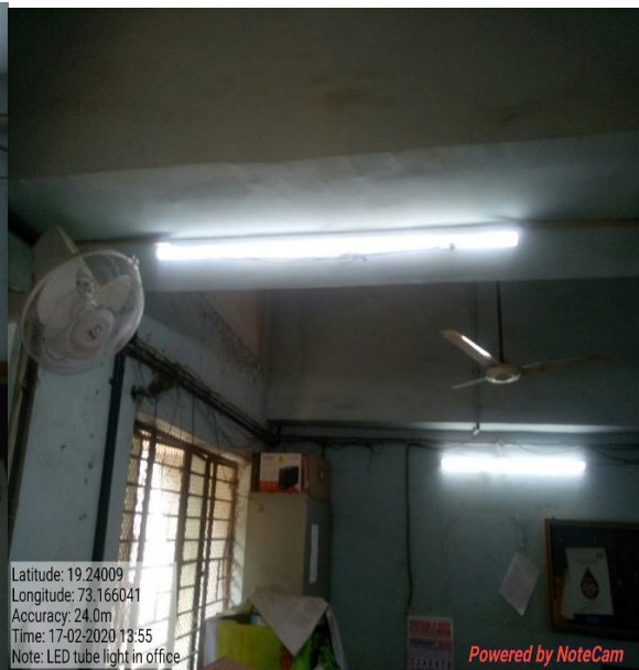
LED Tube light used office