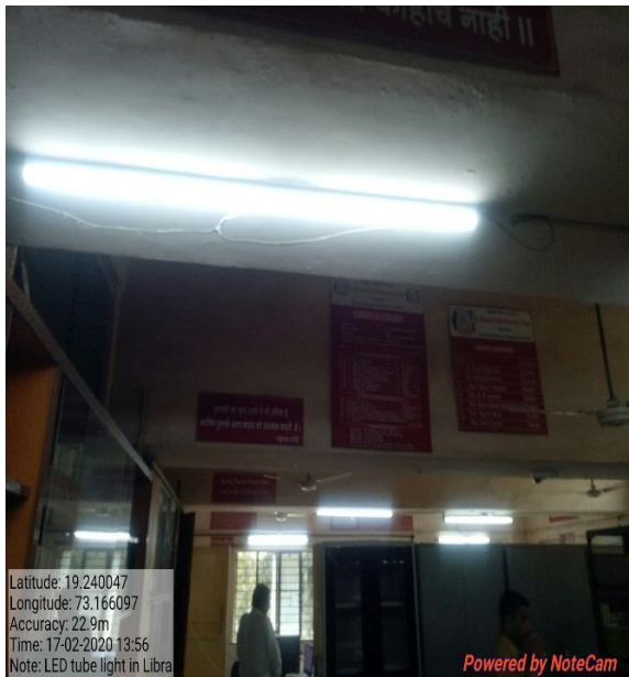
LED tube light used in library internet lab.