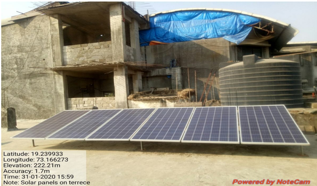
Installation of solar on terrace