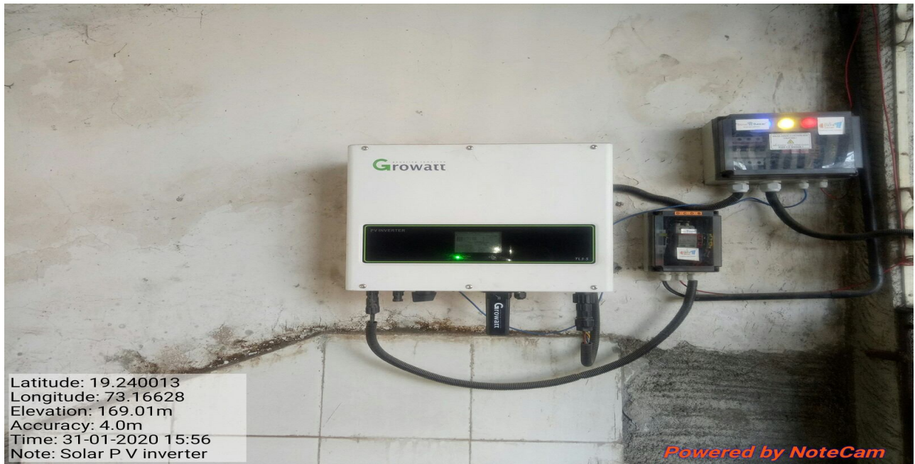
Area Solar installation in college on terrace

Latitude: 19.240013 Longitude: 73.16628 Elevation: 169.01m Accuracy: 4.0m Time: 31-01-2020 15:56 Note: Solar P V inverter