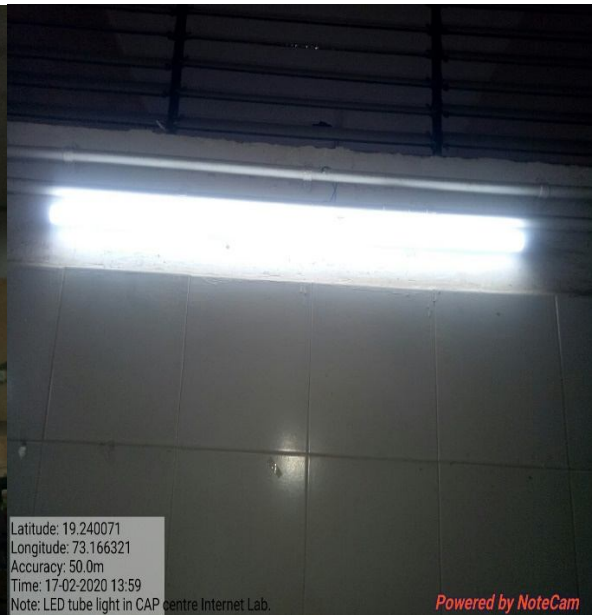
LED tube light in CAP centre and internet lab.