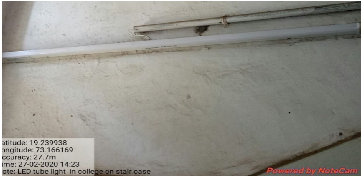
LED tube light in college at staircase