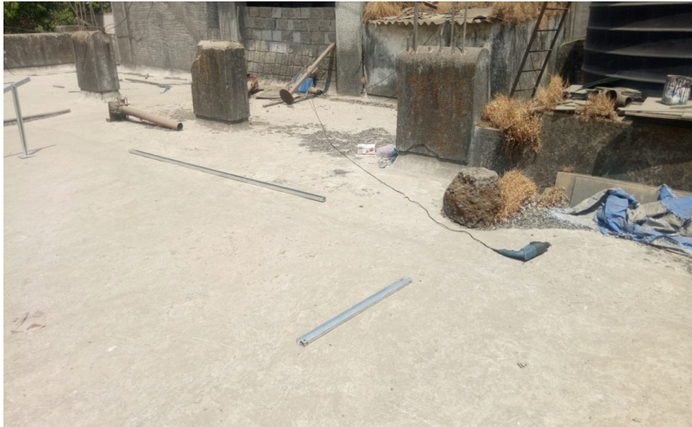
Before installation of solar panel in college on terrace