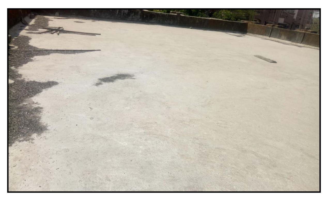
Catchment area of building here roof top rain water harvesting