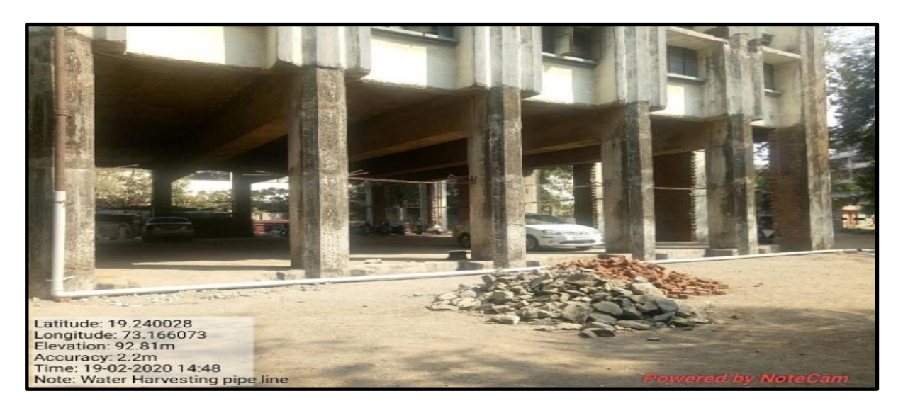
Collection Harvesting water pipeline

PRINCIPAL J. Watumull Sadhubella Girls College Ulhaasnagar-421 001