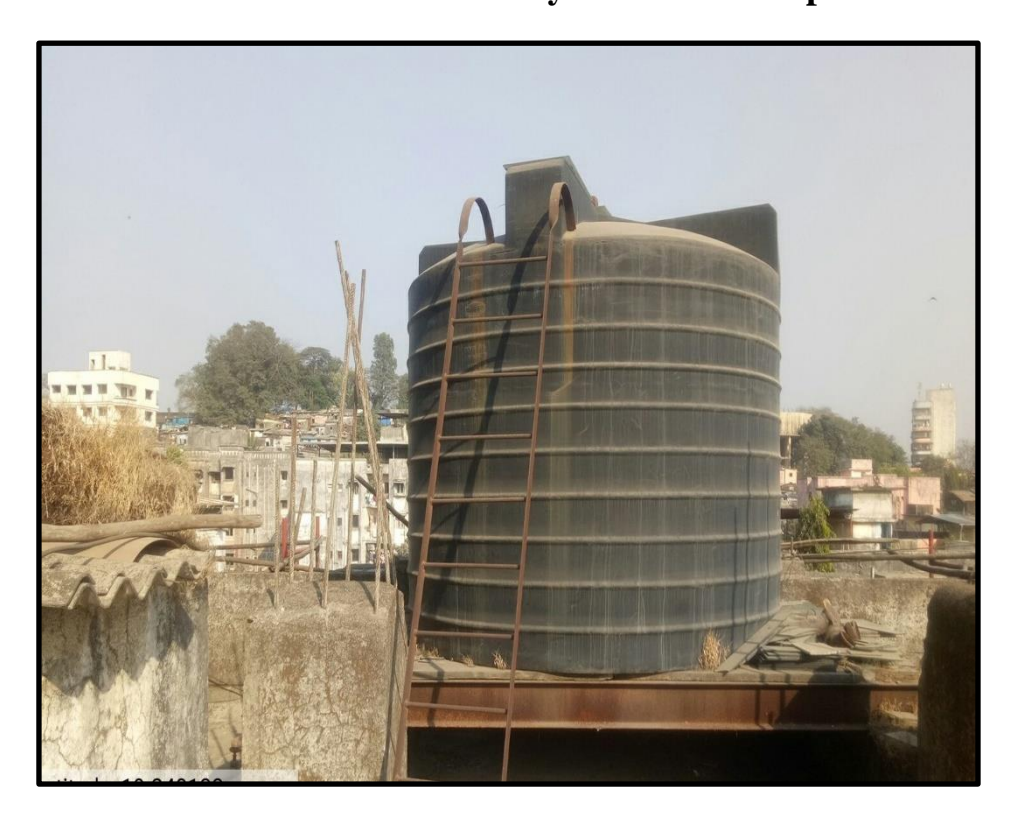
Water storage tank