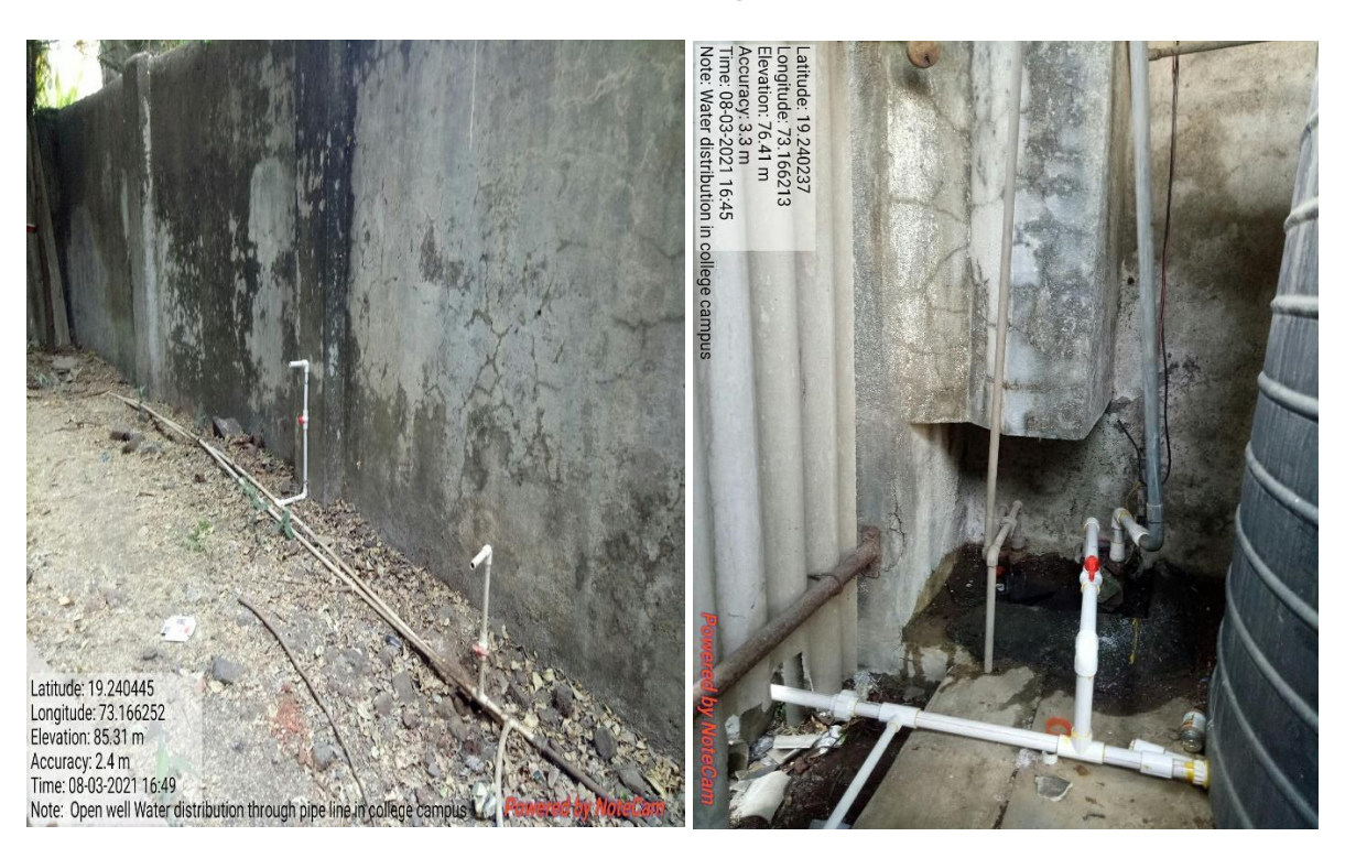
Open well water distribution system in the college campus