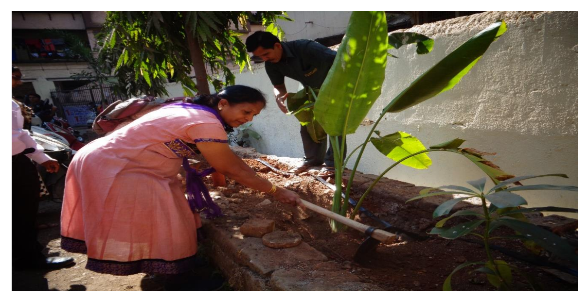
Water distribution through drib (Thibak) method