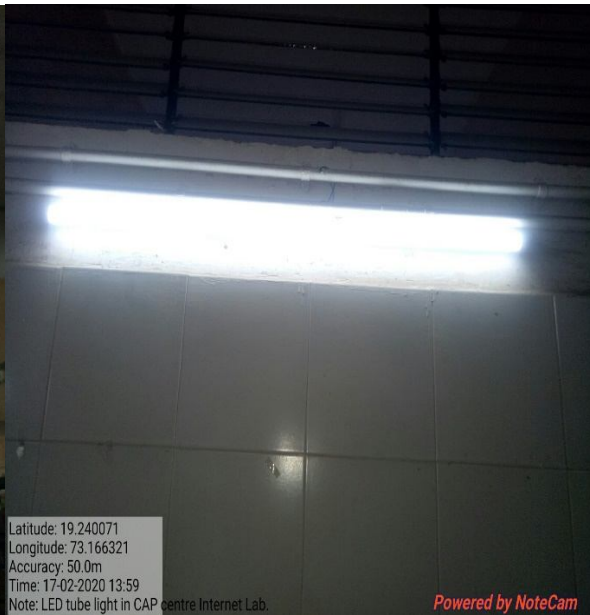
LED tube light in CAP centre and internet lab.