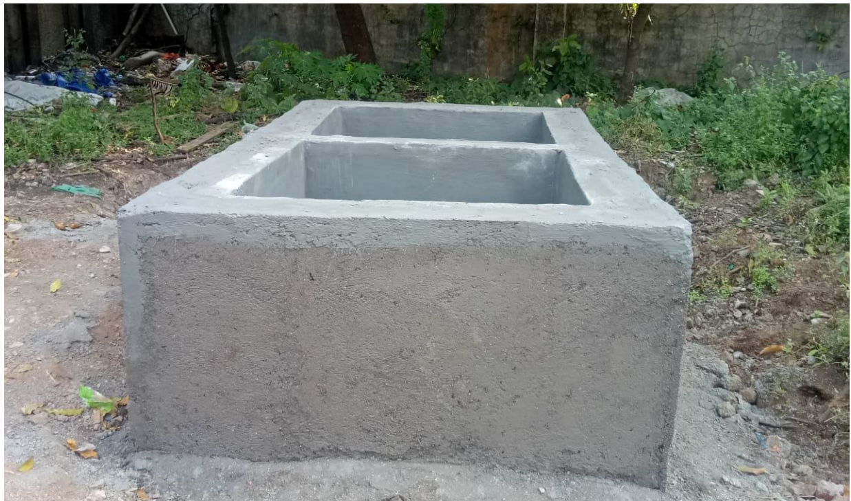
Permanent compost pit for liter in college campus to school side