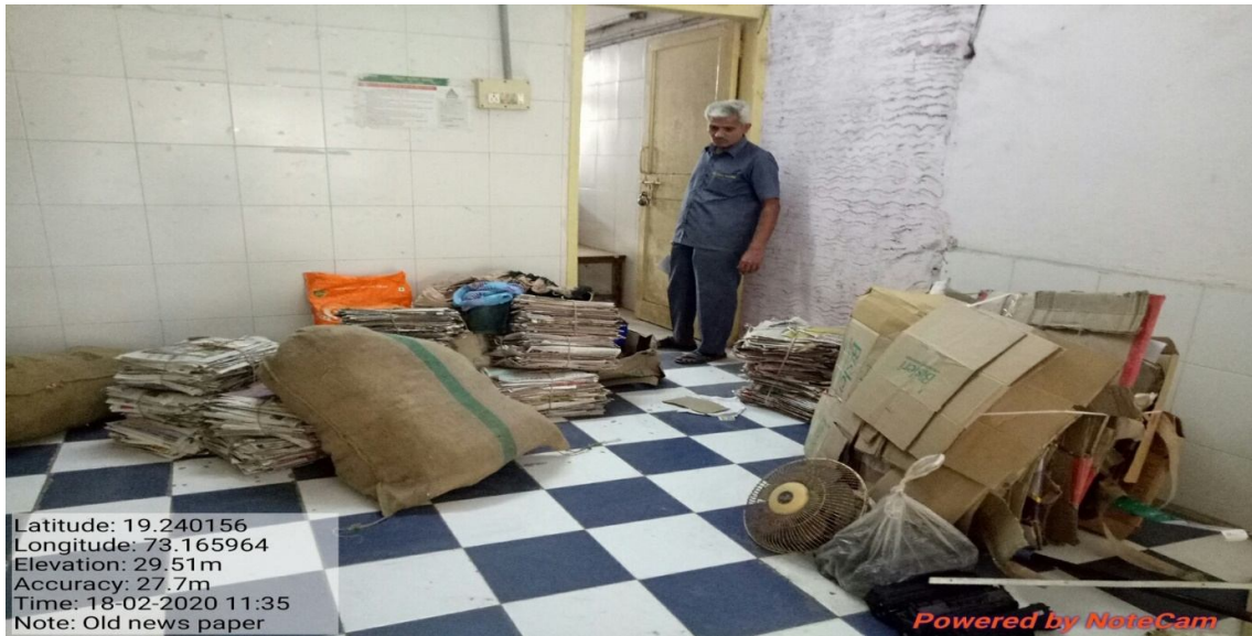
Old news papers sold to scrap purchaser