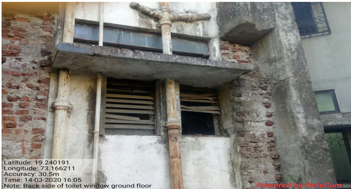
Liquid waste Management through pipeline