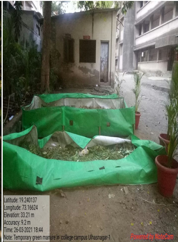
Temporery compost pit in college campus