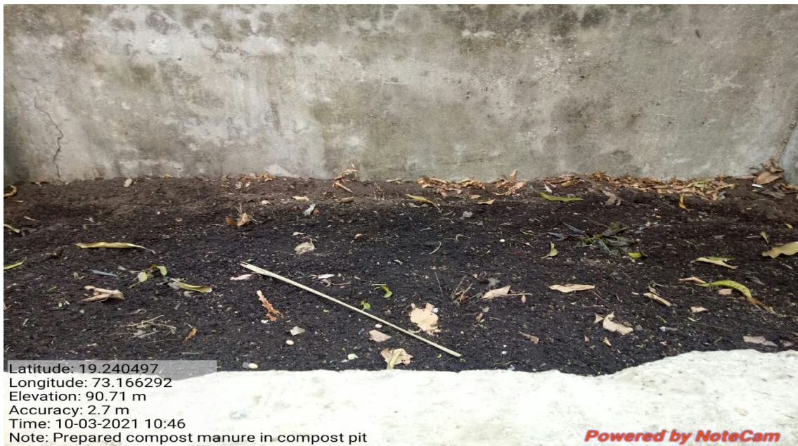
Liter decomposed in compost pit in college gardencampus