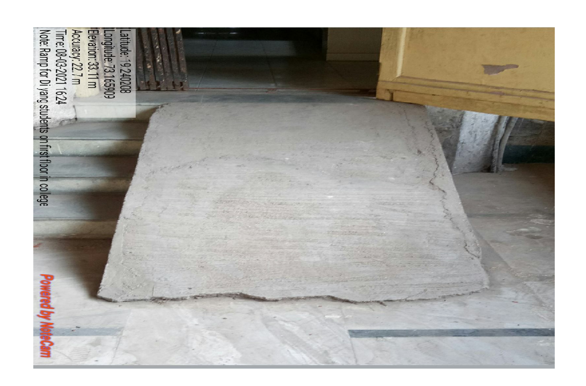
Ramp on first floor for disabled students