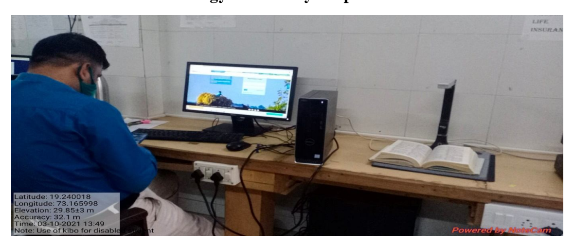
Use of Kibo for disabled students