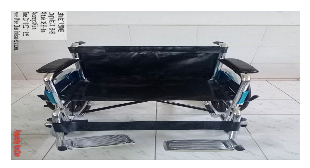
Wheel chair for disabeld students