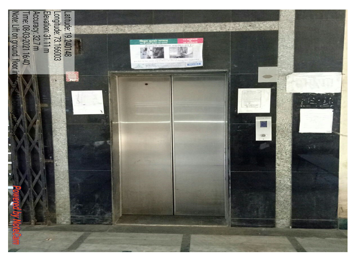
Lifts for disabled students easy access to classroom