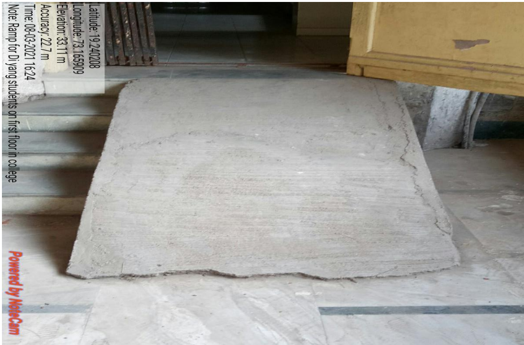
Ramp on first floor for disabled students