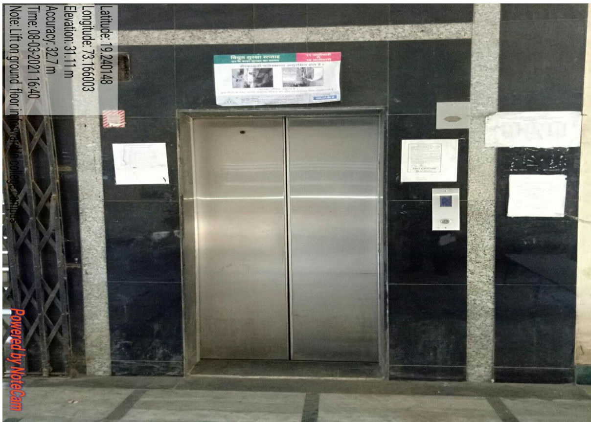
Lifts for disabled students easy access to classroom