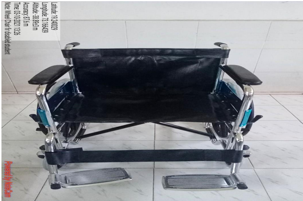
Wheel chair for disabled students