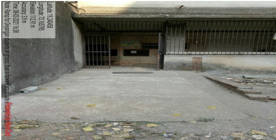
Ramp on ground floor for disabled students